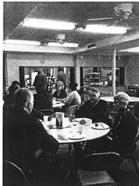
There were 48 voting members attending the Annual Meeting.