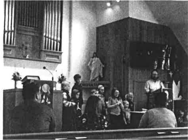
The Sunday School Children entertained the congregation with a couple of songs.