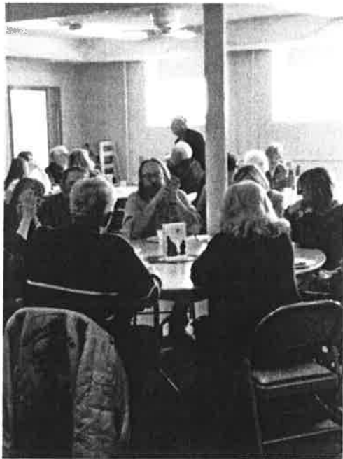
Church members enjoyed a potluck dinner after the meeting.