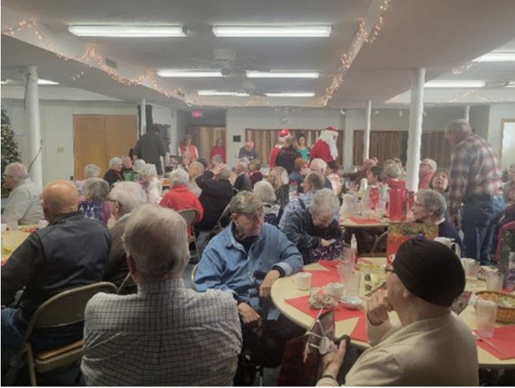
MANY PEOPLE IN THE AREA ATTENDED THE PARTY