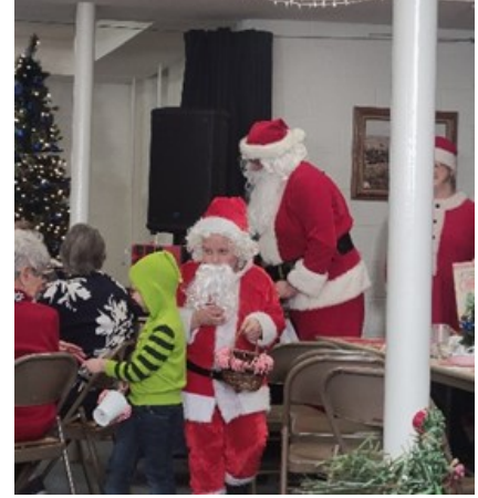
A VISIT FROM SANTA AND MRS. CLAUS