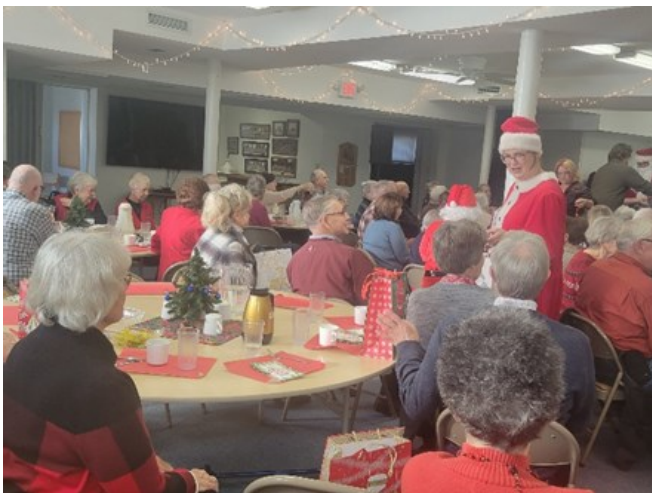
MRS. SANTA CLAUS VISITING WITH THE GUESTS