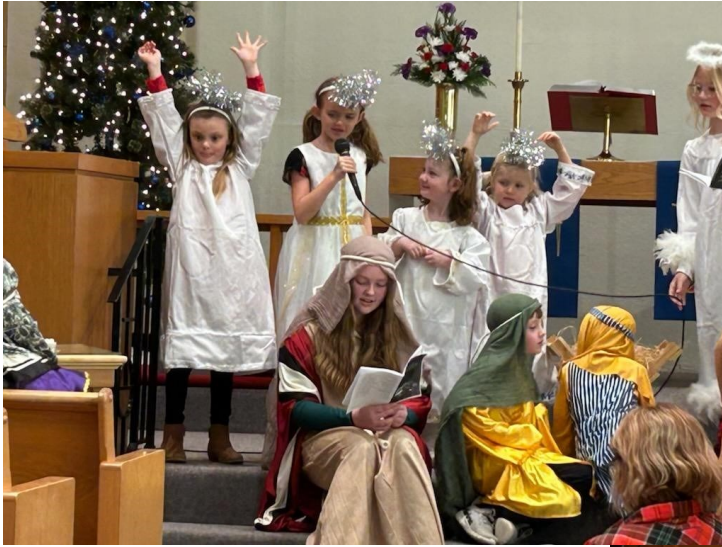
The "Angels" appeared