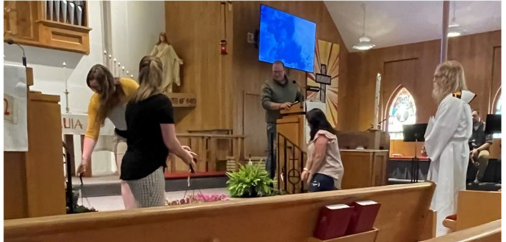
Plants were given to Sunday Day School Teachers.