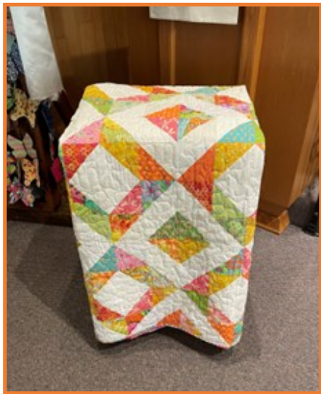
Quilt to be donating to Green Lake Bible Camp for the July Auction.