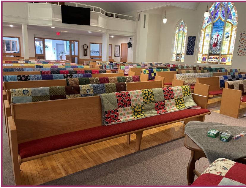
Blessings of the quilts on May 8th service.