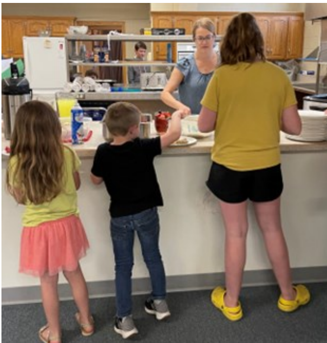
Sunday School children being served pancakes.